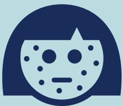
Mumps, Measles, and Rubella (MMR)