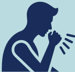
Diphtheria, Tetanus, and Whooping Cough (pertussis)